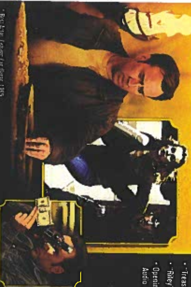
* Best Actor, Forrest Gump , 1994

From Jerry Bruckheimer, producer of Pirates of the Caribbean , and Jon Turteltaub, director of Phenomenon , comes National Treasure . It's the thrilling, edge-of-your-seat adventure starring Academy Award® winner Nicolas Cage* as Benjamin Franklin Gates. Ever since he was a boy, Gates has been obsessed with finding the legendary Knights Templar Treasure, the greatest fortune known to man. As Gates tries to find and decipher ancient riddles that will lead him to it, he's dogged by a ruthless enemy (Sean Bean, The Lord of the Rings trilogy) who wants the riches for himself. Now in a race against time, Gates must steal one of America's most sacred and guarded documents — the Declaration of Independence — or let it, and a key clue to the mystery, fall into dangerous hands. Heart-pounding chase, close calls and the FBI turn Gates' quest into a high-stakes crime caper and the most exciting treasure hunt you've ever experienced.