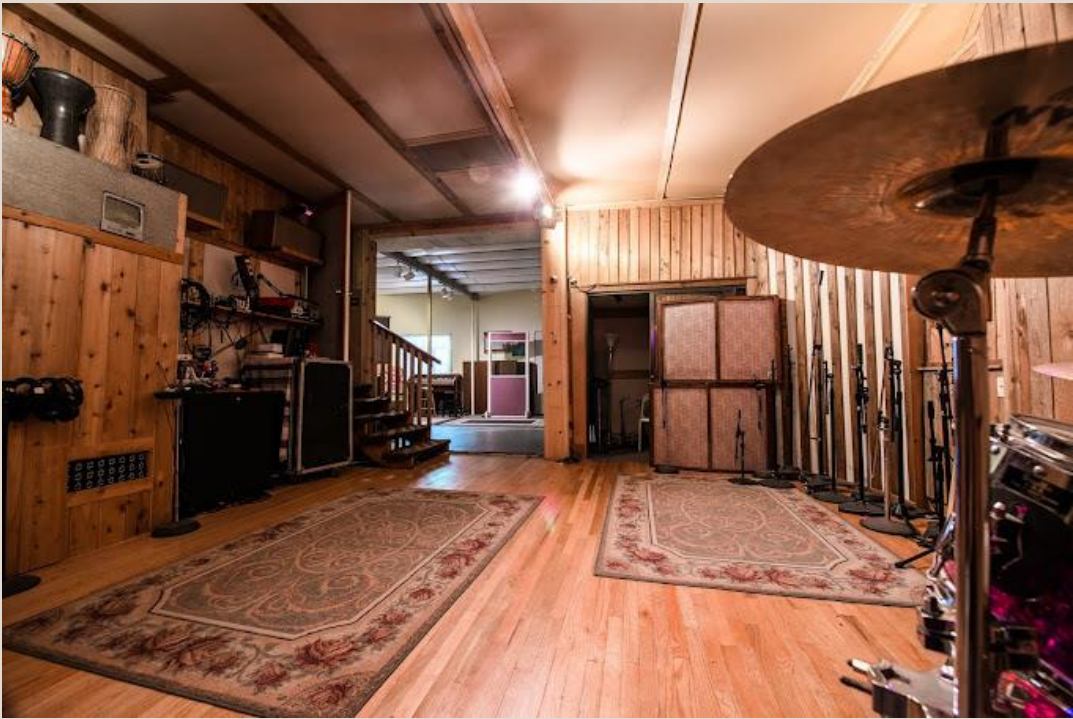
Congress House Studios, Austin, TX