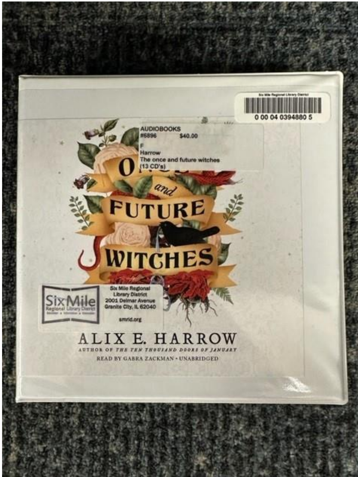
Front of container